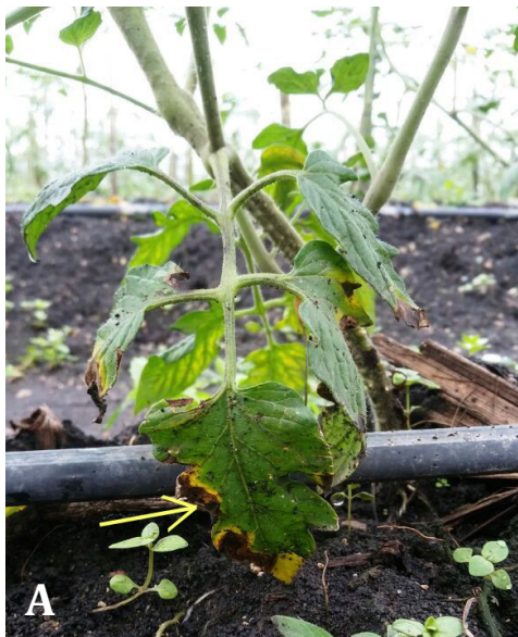
Photo 2. Early blight disease caused by Alternaria solani in leaf (A) and stem (B) of tomato plants 45 days after transplant.

Foto 1. Rendimiento de frutos en plantas de tomate tratadas con B. subtilis y ácido salicílico aplicado a la raíz/follaje, en zona de la Meseta Comiteca, La Trinitaria, Chiapas, México.