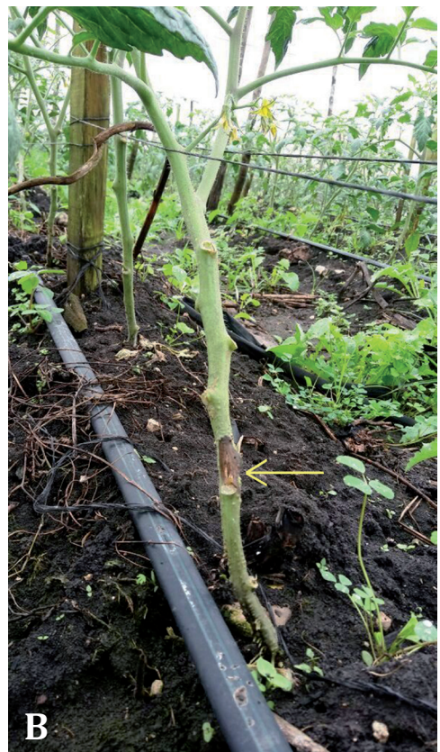
Foto 2. Enfermedad del tizón temprano causado por Alternaria solani en hoja (A) y tallo (B) de plantas de tomate a 45 días después del trasplante.