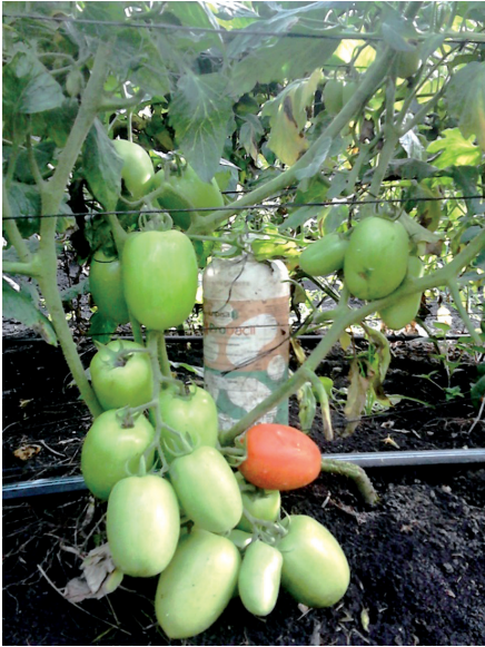
Photo 1. Fruit yield in tomato plants treated with B. subtilis and salicylic acid applied to the root/foliage, in the plateau of Comitán, La Trinitaria, Chiapas, Mexico.

Foto 1. Rendimiento de frutos en plantas de tomate tratadas con B. subtilis y ácido salicílico aplicado a la raíz/follaje, en zona de la Meseta Comiteca, La Trinitaria, Chiapas, México.